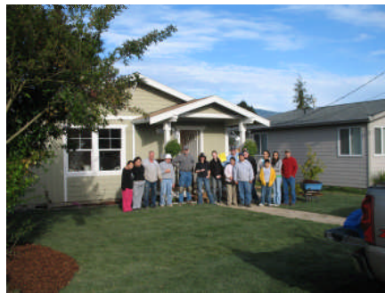
Soto Family Home