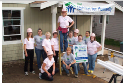
Women Build Group